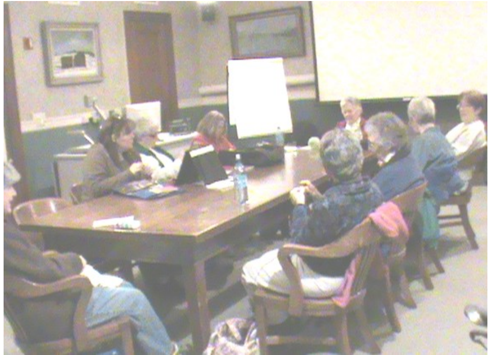
Stories & stitches—a winning combination!